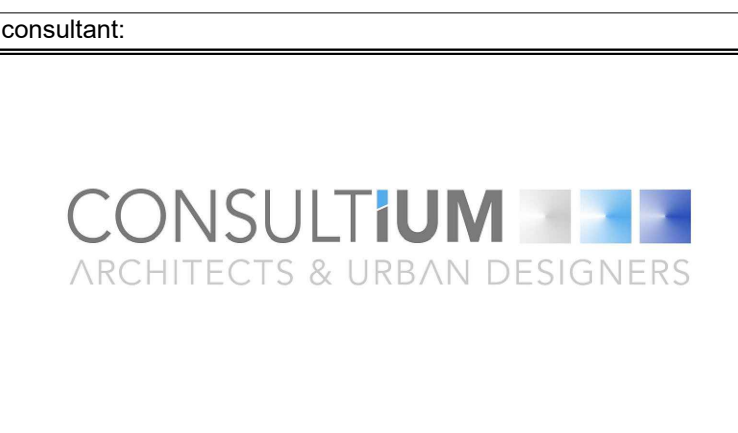
discipline: ARCHITECTURE - WORKING DRAWINGS service: MKHONDO COMMUNITY HEALTH CLINIC ERF NO: 1827 ETHANDAKUKHANYA